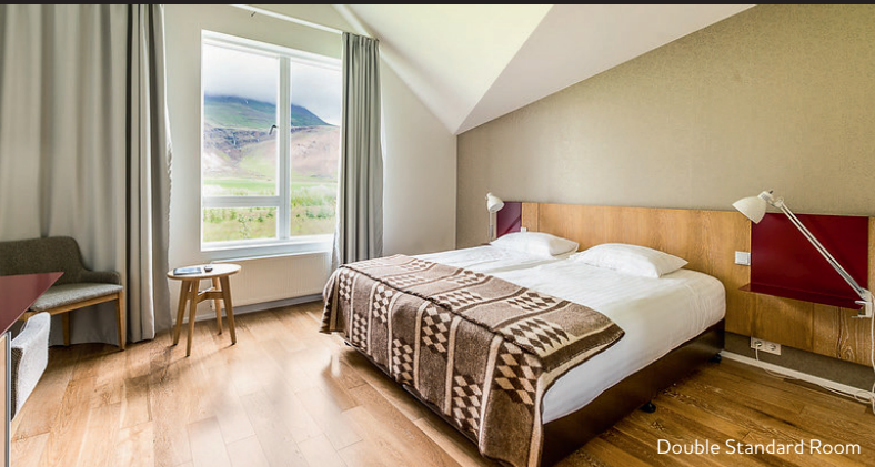
Double Standard Room